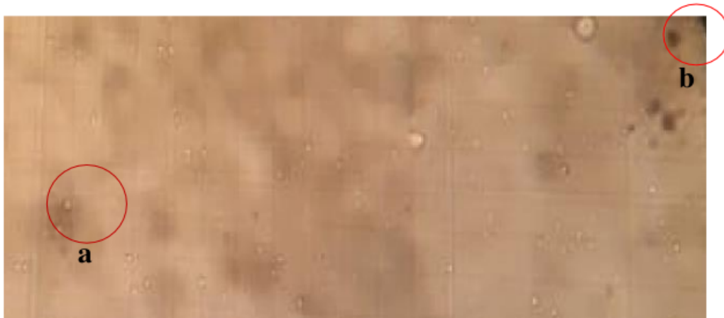
Figure 1. (a) Active and (b) inactive Macrophages

Phagocytosis Activity. The mechanism of phagocytic activity must be on a clear platelet, on essential thrombocythemia based on in-vitro treatment [12]. Phagocytosis activity refers to the percentage of macrophage cells consumed latex by the active macrophage. The phagocytosis mechanism is dynamic, and its phagocyte latex ability forms toxins. Thus, immunostimulants can stimulate bacterial infection [13,14]. In this research, the researchers found the fish improved the non-specific immune responses against V alginoliticus after administering herbal supplementation with Sauropus androgynous [15]. Figure 1 shows the macrophage activity in activated macrophages with 400x zoom under a microscope.