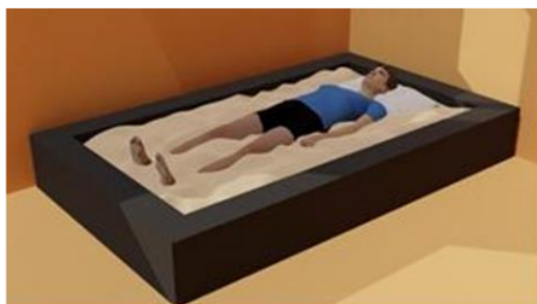
Figure 2: Sleeping position on sand

The results of in-depth interviews with the elderly, village leaders, and nurses stated that a form of cultural creativity in making a sandbox to be used as a mat for resting or sleeping uses white sand and uses ceramic or cement as a container as presented in Figure 1. The sleep duration for elderly informants and the community is 7-8 hours at night, on average, the informants sleep on the sand, the same as the sleep of the community or people who sleep on mattresses, there is no difference, it is just that what distinguishes the mat used is sand for sleeping, which generally uses a mattress or carpets and so on. The people of Legung village use sand mats for their resting places, and sleeping positions on sand used by the elderly are: